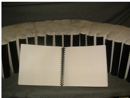
an entire braille Bible